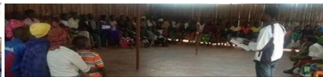
Back to school campaign with primary dropouts and their parents on 11 th January, 2019