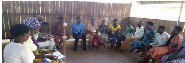
Back to school campaign with secondary school dropouts' and their parents on 3 rd January, 2019

Dropout remains a serious problem in most developing countries today, and Rwanda included. Consequently, it is a great challenge to the different spheres of social, economic, political and cultural life. To cope with those multiple consequences of dropping out, our Organization embarked on the process of addressing the problem. It is on that regard “ Back to school campaign ” carried out by ASINTEDUC RWANDA on 3 rd January, 2019 to secondary drop out students and their parents as well as on 11 th January, 2019 to primary drop out children and their parents. It was in the framework of raising awareness to fight against the remarkable violence of children's right, resolution for the prevention of high dropout rate by the nonviolent method.